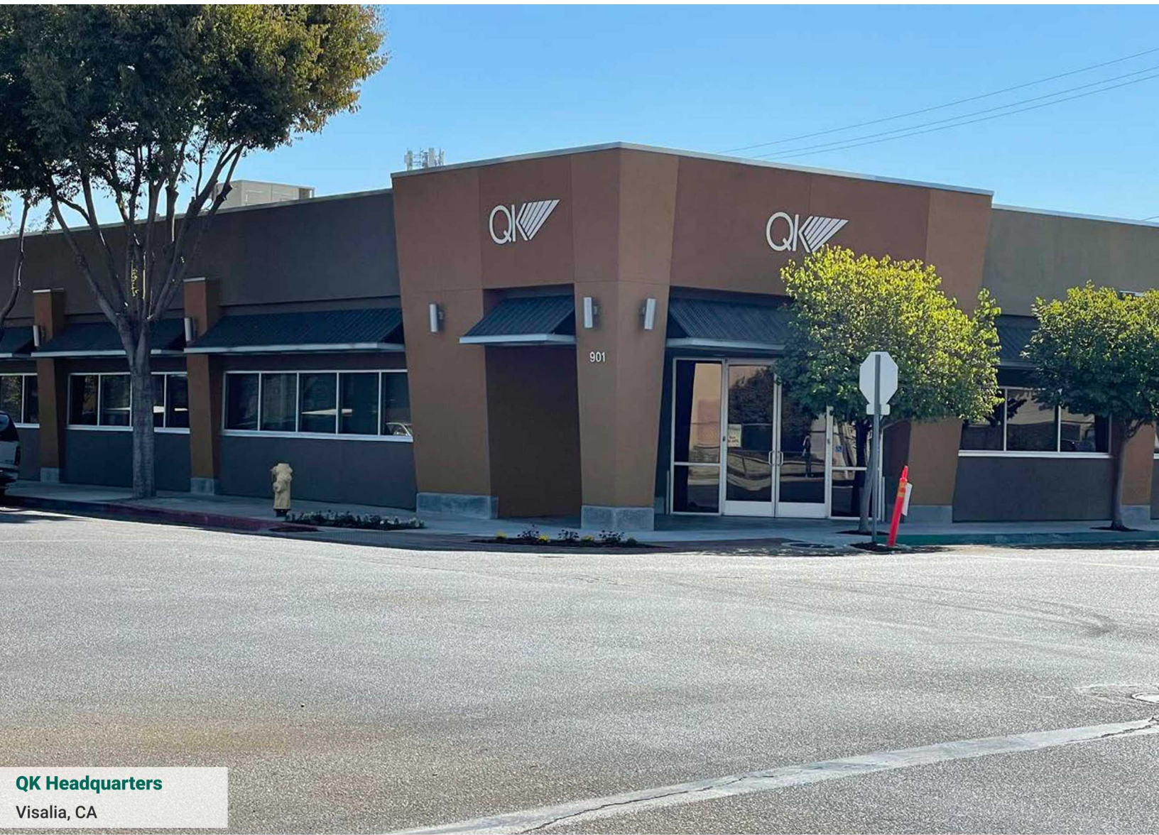
QK Headquarters Visalia, CA