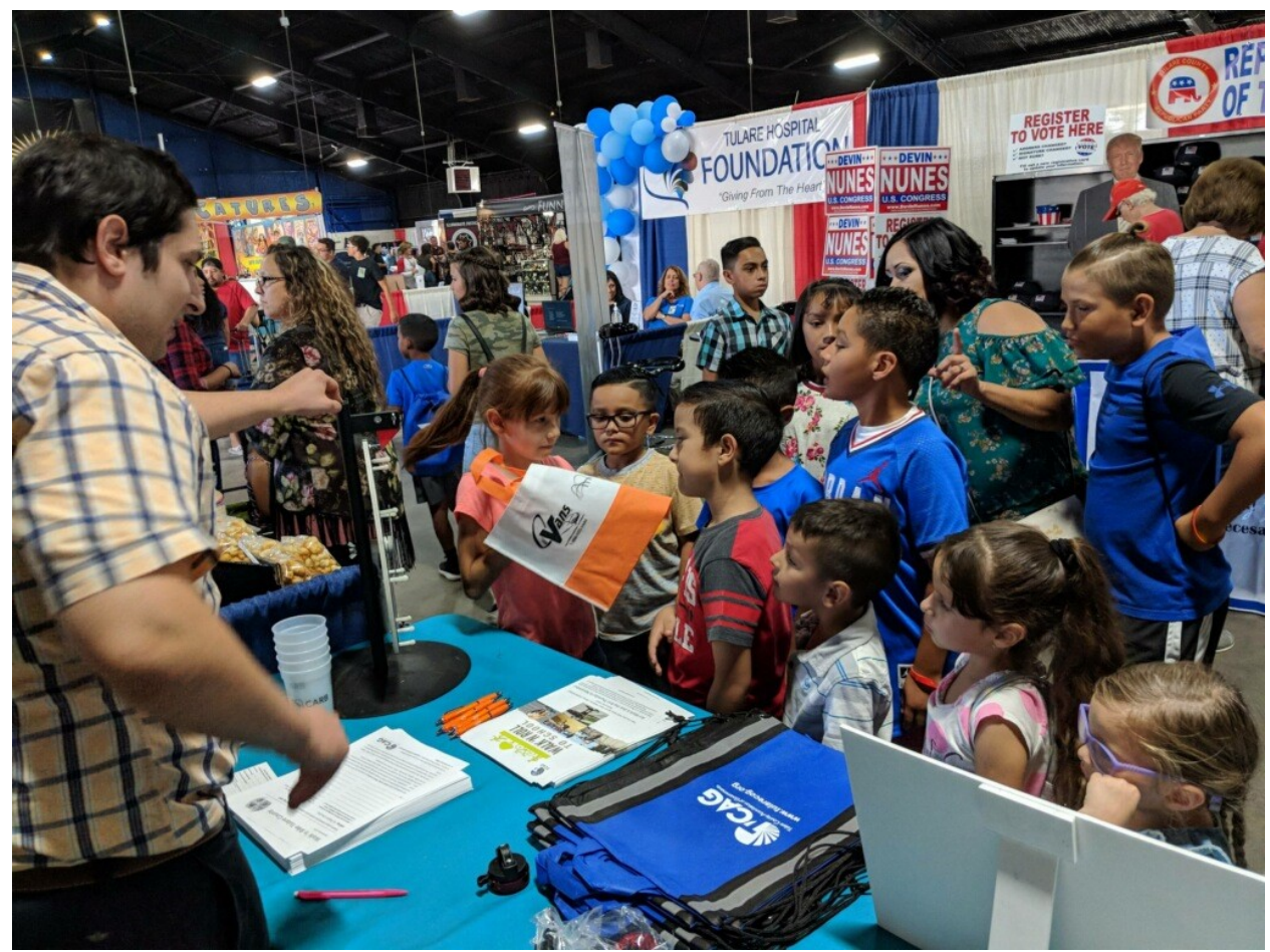
TCAG at the 2019 Tulare County Fair collecting public input on survey, sharing Census information, promoting bike and pedestrian safety practices and the Walk &Roll Student Art Contest.