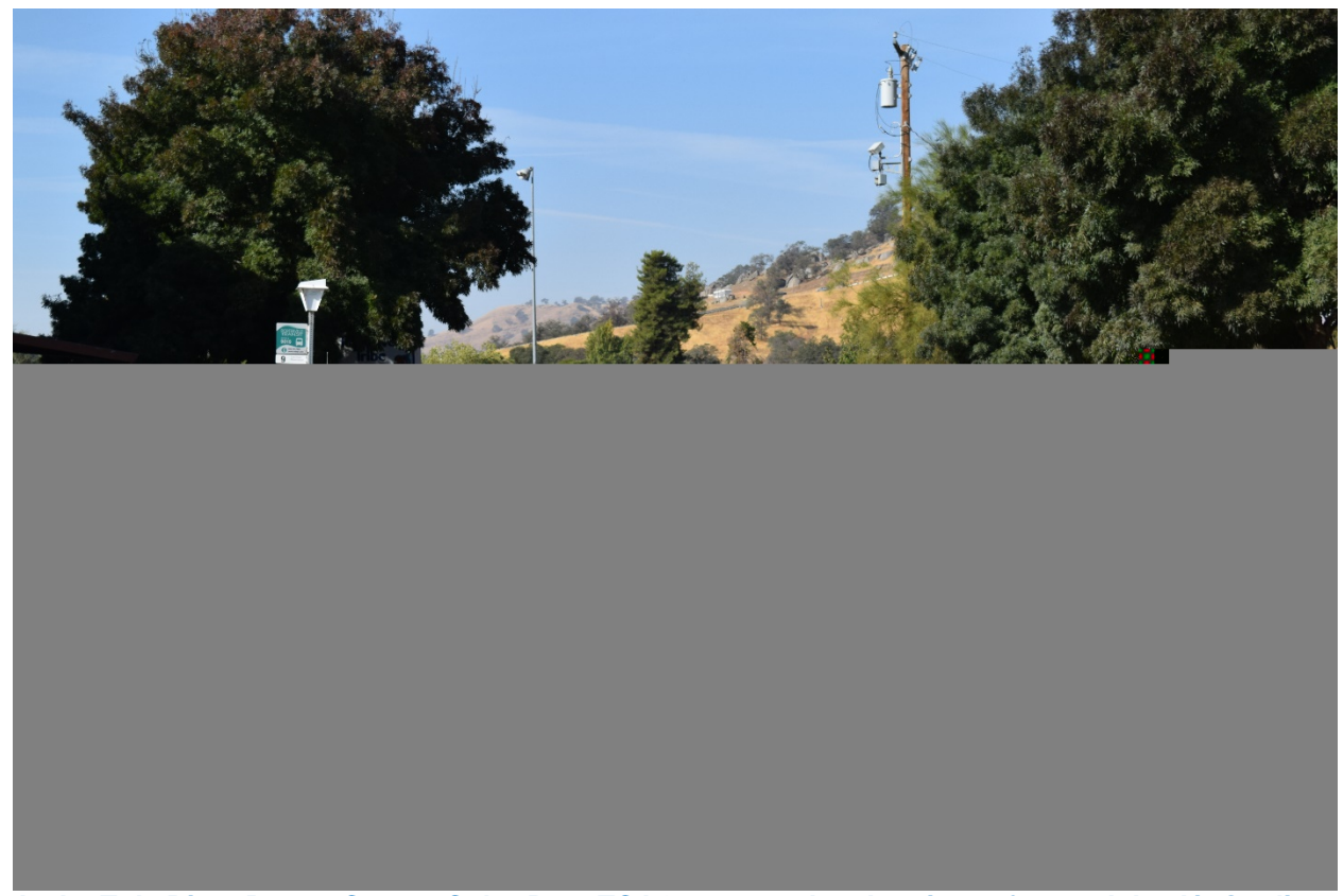
At the Tule River Breast Cancer Color Run, TCAG promoted pedestrian safety and the Air Quality Art Contest for kids. (Reservation Road, Tule River Reservation.