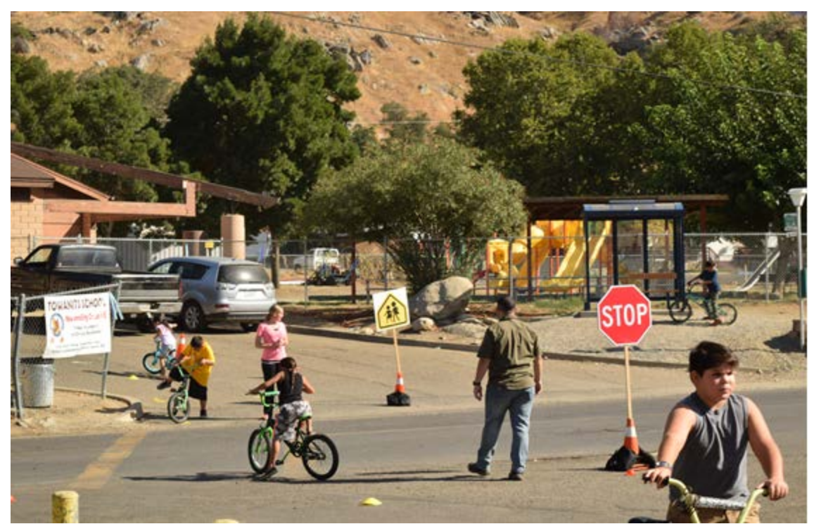
Tule River Tribe Reservation Center Bike Rodeo-October 2019.