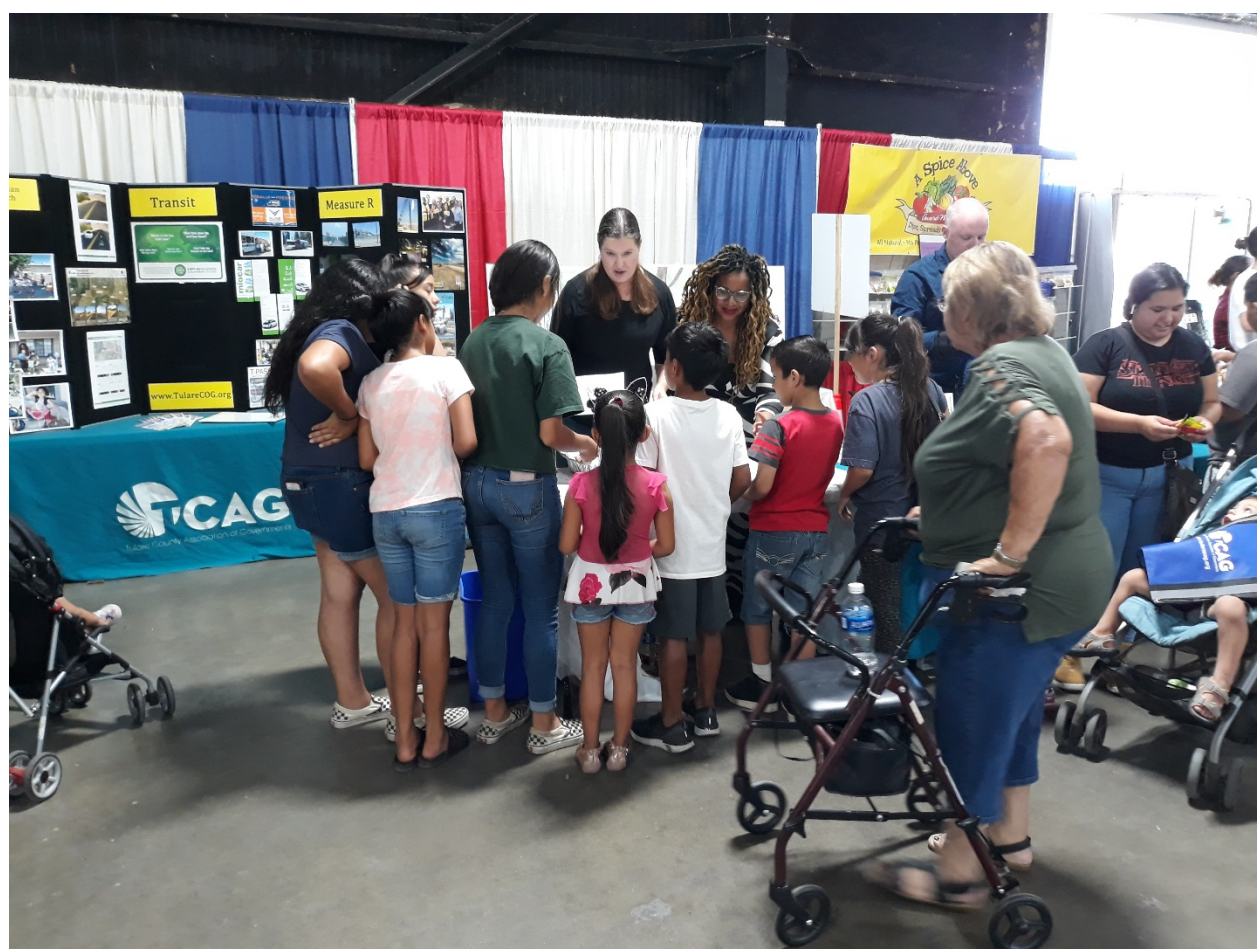
TCAG Staff at Tulare County Fair Booth- sharing transit, Calvans rideshare, Amtrak, bike and pedestrian safety, and Air Quality Art Contest information. Feedback was received regarding barriers to active transportation.