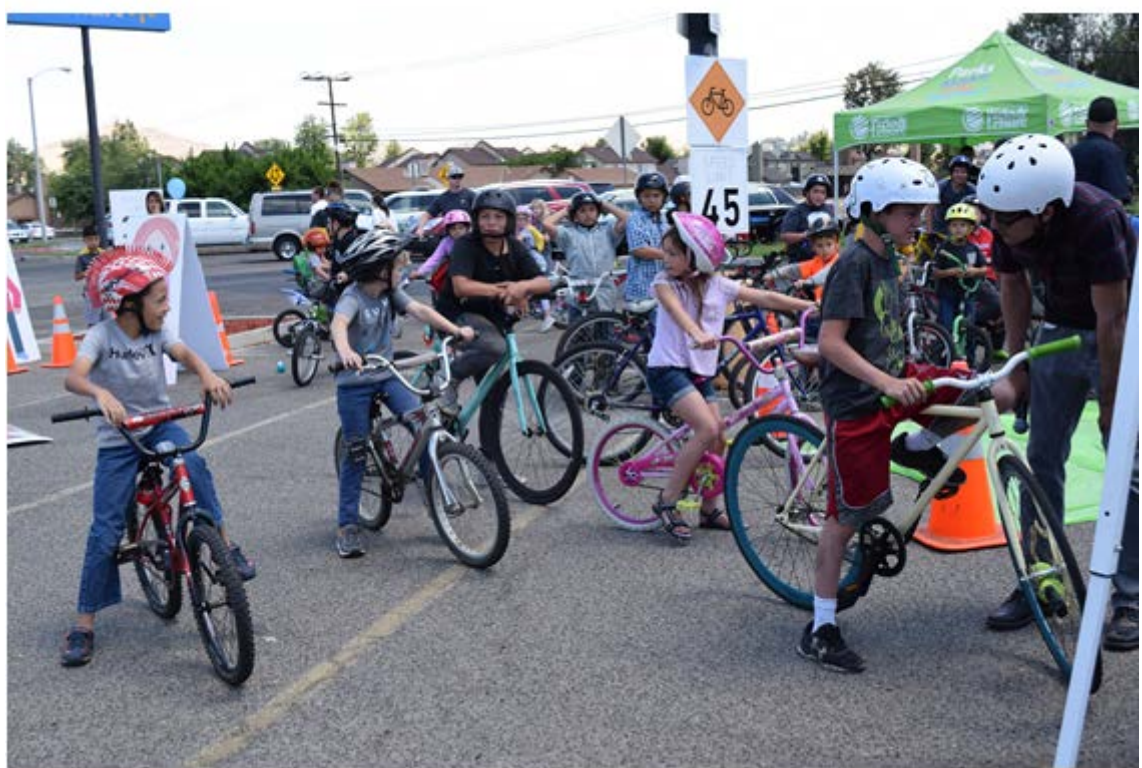
Porterville Community Bike Rodeo with Porterville Police Department, CASA of Tulare County and Tulare County Sheriff department and many more.

The public draft plan was made available for a month-long comment period. The plan was presented to the public at six different community meetings held at various locations throughout the County. During this time, the document was also presented to the TCAG Board for comments. Comments received on the draft plan were incorporated as appropriate into the final version of the plan.