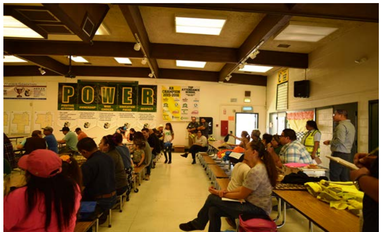
Ivanhoe Community Pedestrian & Bicycle Safety Workshop at Ivanhoe Elementary in collaboration with Berkeley SafeTREC, California Walks, County of Tulare, Highway Patrol and California office of Traffic Safety.

Tule River Bike Rodeos: Since the 2015 Public Participation Plan, one of the greatest TCAG successes has been the partnership with the Tule River Tribe for bike rodeos. For these events, TCAG mapped out bicycle courses complete with markings and signage to practice with live traffic on the main reservation roadway. Children ages 2 through 15 learned how to ride using hand signals, obeying traffic signs and practical bike safety habits in an area with limited active transportation infrastructure. The event was held in collaboration with Tule River Tribe Recreation Center staff, Tule River Police and Fire Department. All agencies set up stations to teach about safety and to encourage safe active transportation. Bike helmets and bike safety equipment were provided at the events by TCAG and generous community partner donations. Additionally, these bike rodeos led to TCAG participation in other Tule River reservation events.