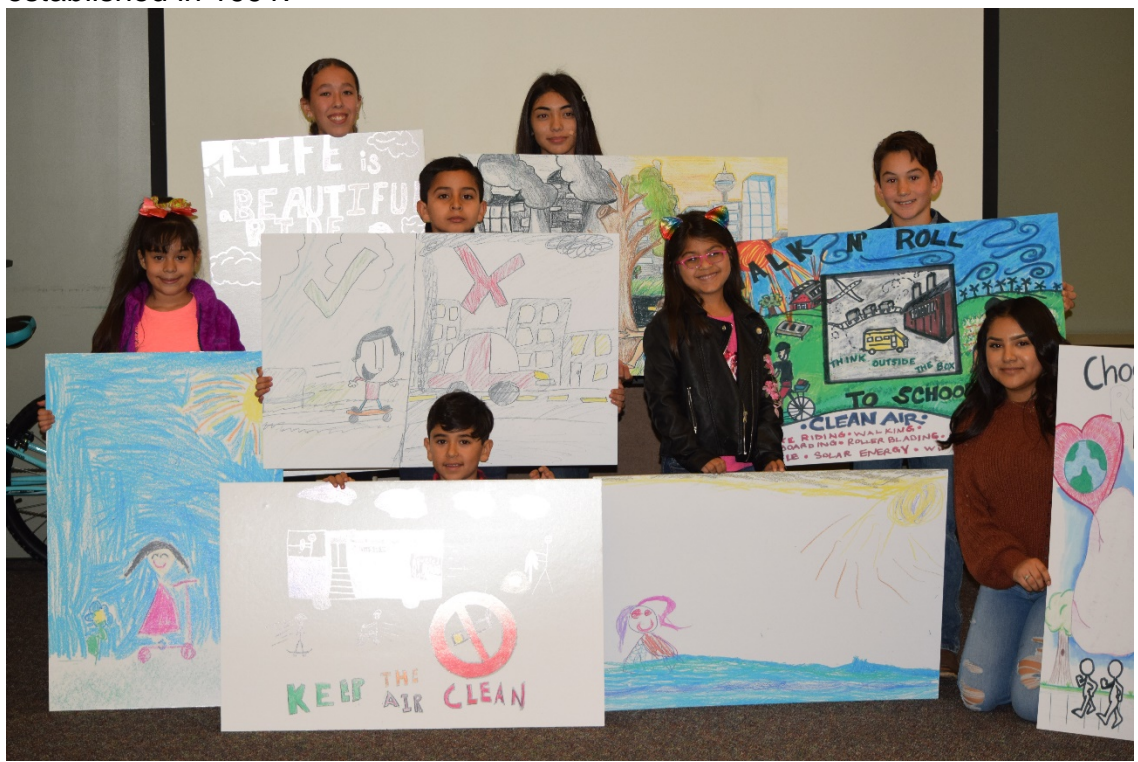
Winners of 2019 K-12 Walk & Roll Air Quality Art Contest.