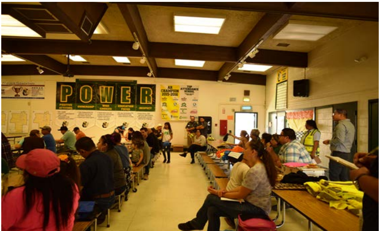
Ivanhoe Community Pedestrian & Bicycle Safety Workshop at Ivanhoe Elementary in collaboration with Berkeley SafeTREC, California Walks, County of Tulare, Highway Patrol and California office of Traffic Safety.

Tule River Bike Rodeos: Since the 2015 Public Participation Plan, one of the greatest TCAG successes has been the partnership with the Tule River Tribe for bike rodeos. For these events, TCAG mapped out bicycle courses complete with markings and signage to practice with live traffic on the main reservation roadway. Children ages 2 through 15 learned how to ride using hand signals, obeying traffic signs and practical bike safety habits in an area with limited active transportation infrastructure. The event was held in collaboration with Tule River Tribe Recreation Center staff, Tule River Police and Fire Department. All agencies set up stations to teach about safety and to encourage safe active transportation. Bike helmets and bike safety equipment were provided at the events by TCAG and generous community partner donations. Additionally, these bike rodeos led to TCAG participation in other Tule River reservation events.