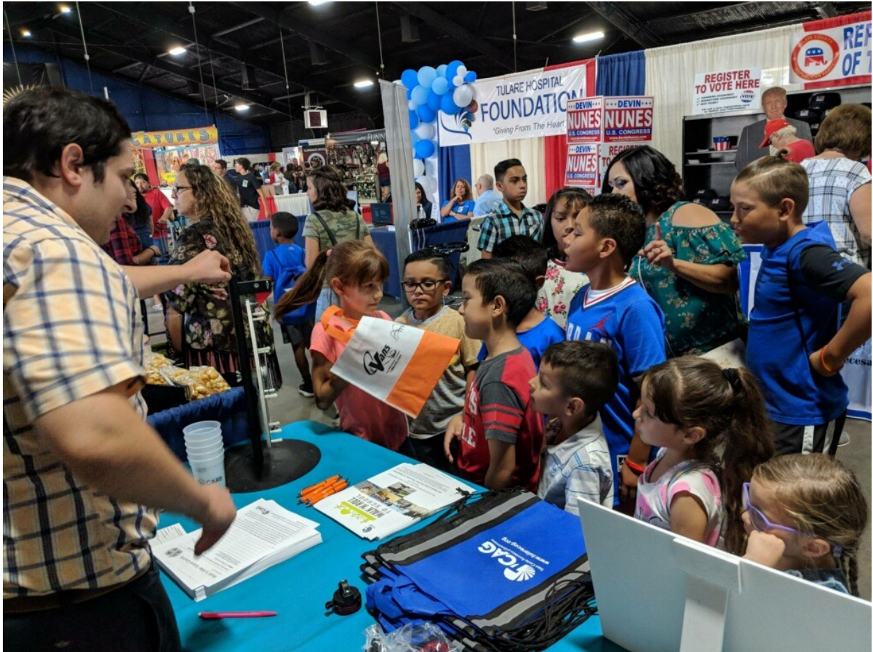
TCAG at the 2019 Tulare County Fair collecting public input on survey, sharing Census information, promoting bike and pedestrian safety practices and the Walk & Roll Student Art Contest.