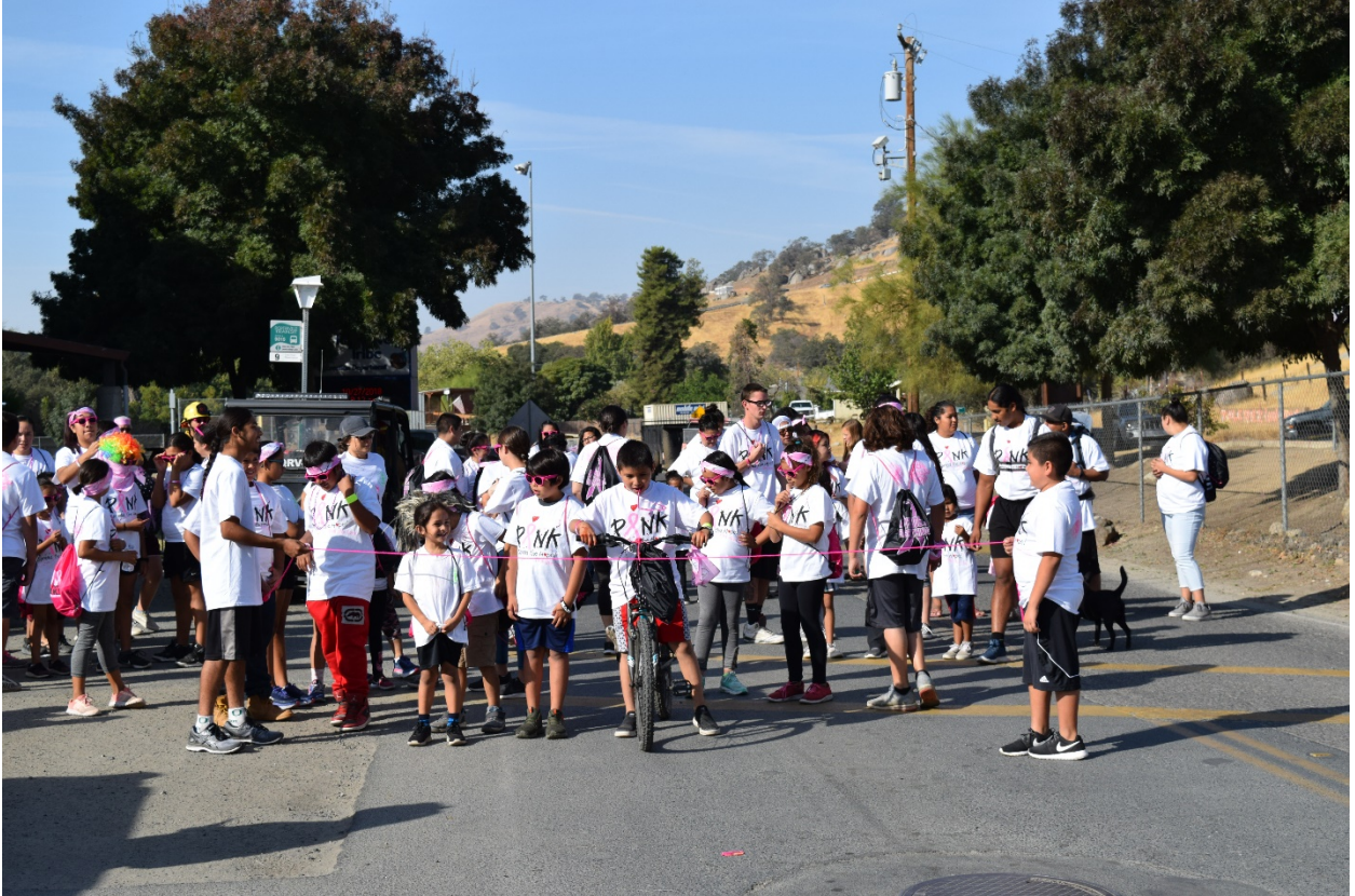
At the Tule River Breast Cancer Color Run, TCAG promoted pedestrian safety and the Air Quality Art Contest for kids. (Reservation Road, Tule River Reservation.