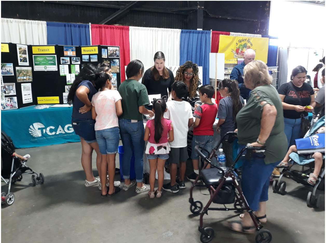
TCAG Staff at Tulare County Fair Booth- sharing transit, Calvans rideshare, Amtrak, bike and pedestrian safety, and Air Quality Art Contest information. Feedback was received regarding barriers to active transportation.