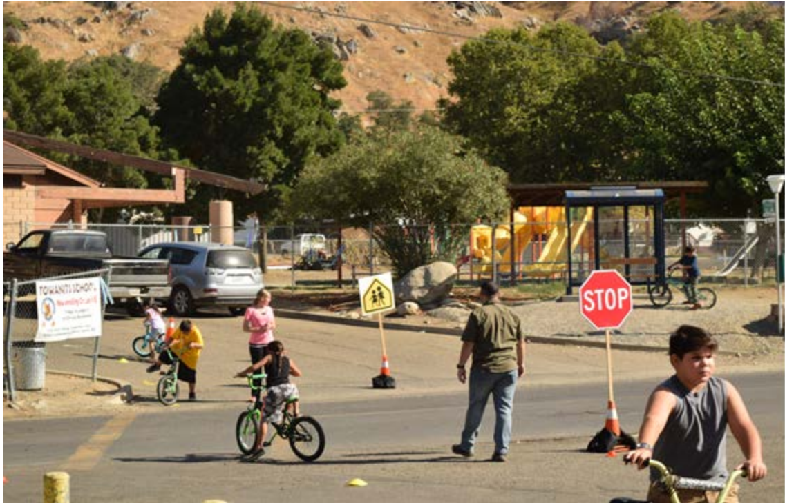
Tule River Tribe Reservation Center Bike Rodeo-October 2019.