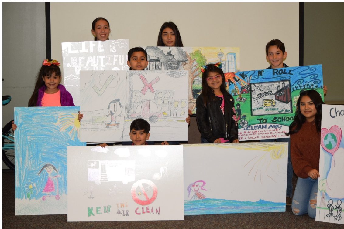
Winners of 2019 K-12 Walk & Roll Air Quality Art Contest.