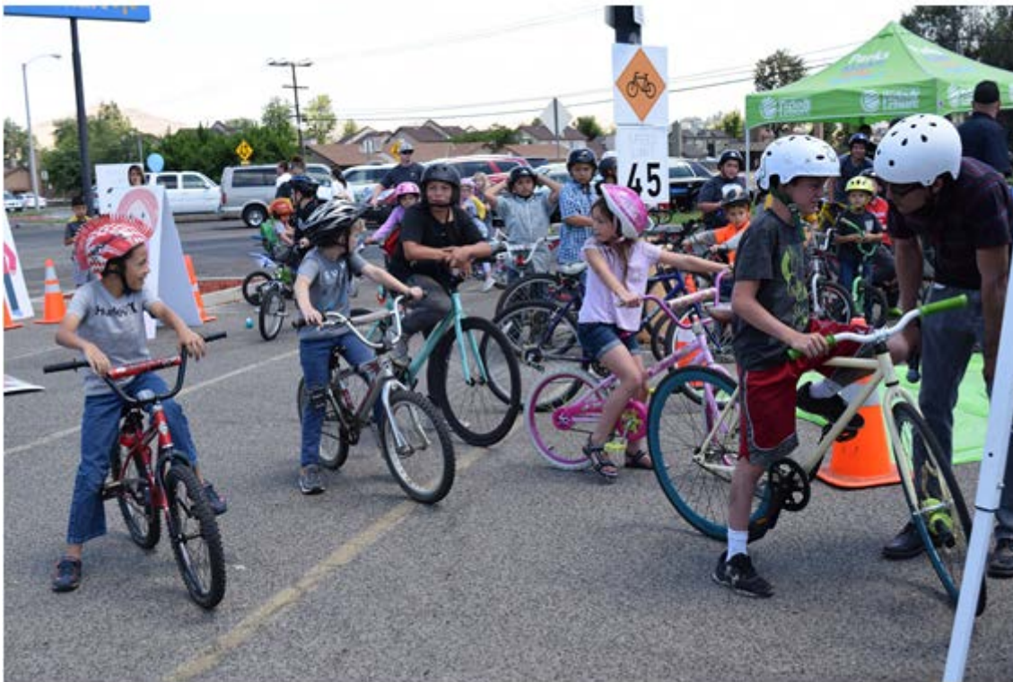
Porterville Community Bike Rodeo with Porterville Police Department, CASA of Tulare County and Tulare County Sheriff department and many more.

The public draft plan was made available for a month-long comment period. The plan was presented to the public at six different community meetings held at various locations throughout the County. During this time, the document was also presented to the TCAG Board for comments. Comments received on the draft plan were incorporated as appropriate into the final version of the plan.