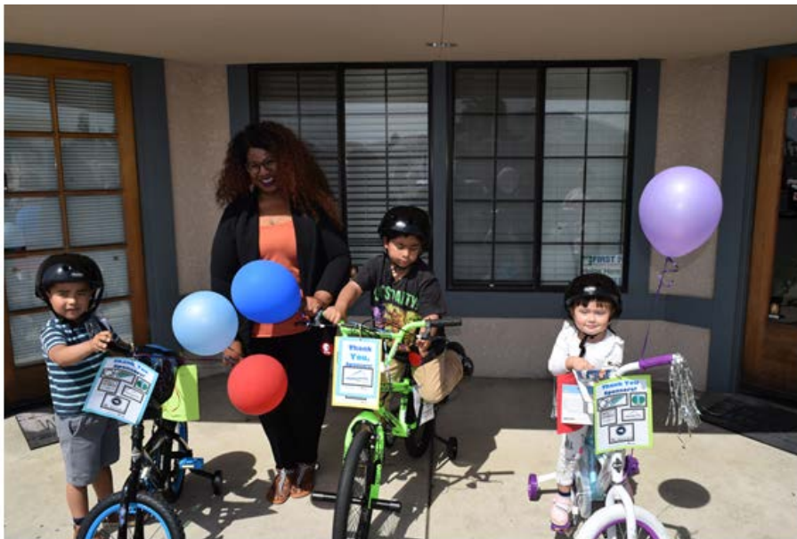
Bike raffle winners at Porterville Parenting Network after a Bike Safety Class for Parents held in collaboration with Porterville Police Department.

TCAG staff actively engages with the public for feedback through various methods and are proud of the continually growing list of partnering organizations that serve Tulare County residents. During public engagement, TCAG takes federal and state laws into consideration as well as best practices and community needs.